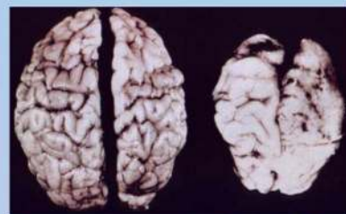
Normal Brain FAS Affected Brain